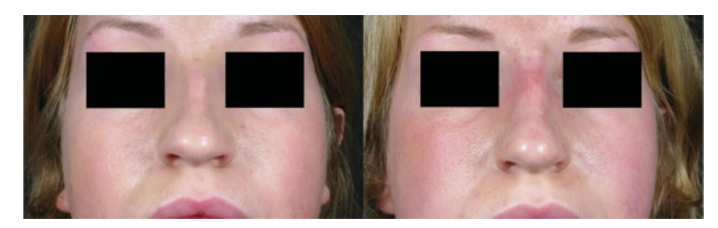
Fig. 4 Correction of a twisted nose (pre- and postoperative),injection of 0.9 mL Radiesse in the radix area, in the dorsum nasi, and in the right lateral pyramid wall.