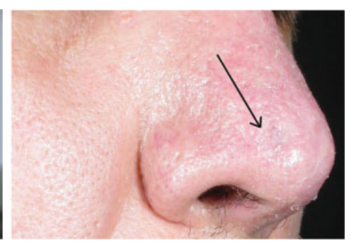
Fig. 11 Pus penetrating through the nasal tip ( left ), and residual scar ( arrow ) after local treatment, multiple previous injections of Radiesse in the dorsum nasi, and surgical rhinoplasty.

HA fillers, as CaHA is harder to inject due to its higher viscosity, and therefore higher pressure has to be applied than with HA fillers, resulting in use of thicker needles. In our study, 23-gauge needles were used to inject CaHA, whereas 27- and 30-gauge needles were used to inject HA.