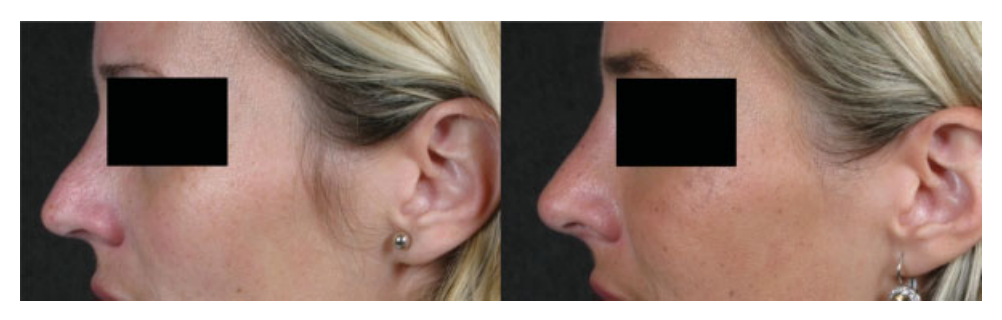
Fig. 3 Correction of a pollybeak deformity (pre- and postoperative), injection of 1.1 mL of Juvéderm 4 in the radix area, in the dorsum nasi, and in the columella.

Harmonization of a twisted nose requires equalization of the concave side of the deformity. The needle entry point is positioned cranially of the concavity, the skin is elevated, and the needle inserted deep into the sub-SMAS, just superior to the periosteum or perichondrium. After aspiration, the needle is gently withdrawn and injection is performed caudocranially in a retrograde manner. The volume of filler required is evaluated by direct vision with the binocular Loupes glasses and palpation. Five patients were treated for