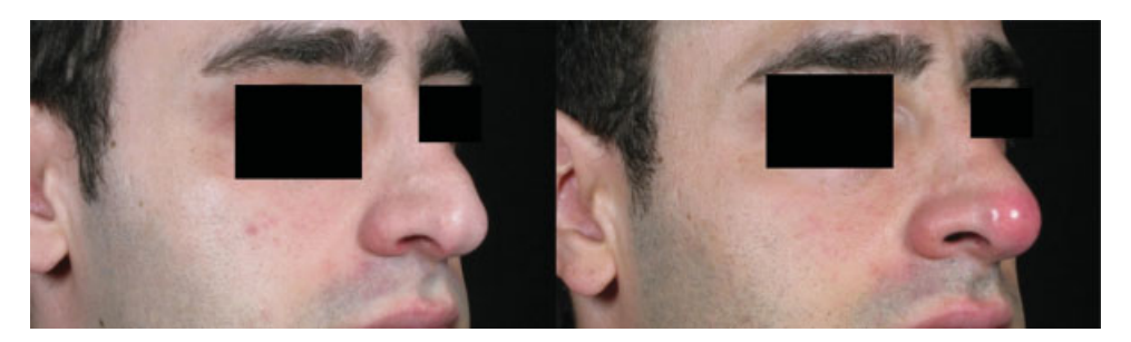
Fig. 9 Painless red nasal tip 2 weeks posttreatment, injection of 1.3 mL Radiesse in the radix area and the columella.

and it was recommended that in-patient treatment was required. The patient rejected this advice and no further information on follow-up was available (>Fig. 10). The third case was a 53-year-old man who underwent several CaHA injections for nose augmentation over the past 5 years, the last of which was with 0.4 mL CaHA 12 months ago. He also underwent corrective surgical rhinoplasty that involved insertion of a polyethylene Medpor splint. There were no reported infections following these treatments. He presented with a history of a blocked nose persisting for approximately 2 weeks, with no obvious signs of infection. Endoscopic inspection revealed a dislocated splint that had protruded through the mucosa of the left nasal cavity and the nose tip revealed a subdermal abscess with skin necrosis ( Fig. 11 ). The abscess was incised, pus removed (microbiological examination indicated staphylococcal infection), and the cavity was cleaned with hydrogen peroxide 4% and ciprofloxacin. This treatment was repeated daily for 10 days, together with oral ciprofloxacin 750 mg twice a day. The splint was shortened under local anesthesia but not removed as per the patient's request. Following treatment, the infection resolved completely and the splint was covered by a layer of mucosa.