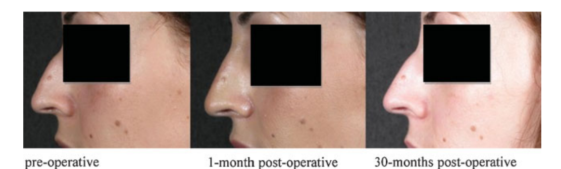
Fig. 8 Treatment longevity of up to 30 months, injection of 0.7 mL Juvéderm 4 in the radix area.

Minor adverse effects in this study comprised one case of filler dislocation, two cases of visible hematoma, and one case of subcutaneous nodules persisting for up to 8 weeks after CaHA injection. However, we also observed one moderate and two severe complications, all following CaHA treatment. The first was a 35-year old man treated for a hump, cartilaginous grooves, and abnormal projection of the columella who presented with a painless red nasal tip 2 weeks posttreatment. Treatment was given with topical corticosteroid (Ecural [Mometasone 17-(2-furoate)]) and cefuroxime antibiotics and resulted in complete remission after 4 weeks (►Fig. 9). The second case was a 48-year-old woman presenting for a dorsum correction after rhinoplasty 15 months previously. We administered 0.4 mL CaHA in the area between the alar and lateral cartilage of the dorsum. As the patient lived some distance from the clinic, we recommended cefuroxime 250 mg as prophylaxis, but she rejected this advice. She presented the following day with local infection at the injection site and punctate skin lesions were observed. Local treatment comprised disinfection with Octenisept and hydrogen peroxide 4%, and Aureomycin antibiotic ointment. The patient insisted on returning home, but 72 hours later she sent photographs that indicated skin necrosis. We arranged a consultation at a local ENT and facial plastic surgery department whereupon necrosis was not confirmed, but extensive infection was diagnosed