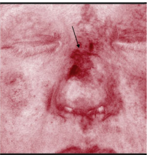
Fig. 10 Punctate skin lesions evident on first postoperative day after calcium hydroxyapatite (CaHA) injection of the dorsum ( left ), and cross-polarized light showing hyper- and hypoperfusion in the tip area indicated by the arrow ( right ).