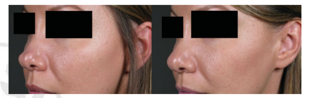
Fig. 5 Equalization of grooves due to cartilaginous irregularities (pre- and postoperative), injection of 1.0 ml Juvéderm 4 in the grooves between the alar cartilages.

this deformity and the amount of filler used varied between 0.5 and 0.9 mL ( Fig. 4 ).